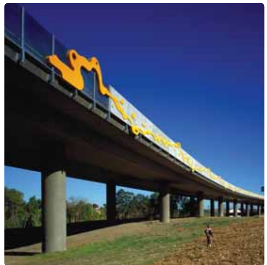
Figure 4 above: M4 motorway, Parramatta, Australia - GRC and acrylic panels.

would provide a sound reduction of approximately 30dB.